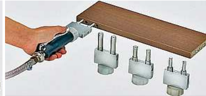
PZ0008-PZ0011 6/8/10/12 mm