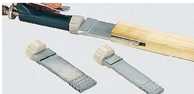
PZ0018-PZ0023 *1 30/40/50x100x6