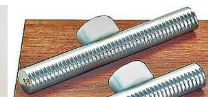
PZR0031-PZR0033 72/120/180 mm