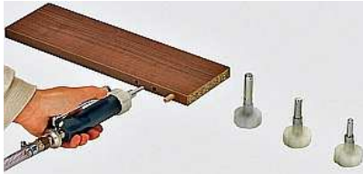
PZ0004-PZ0007 6/8/10/12 mm