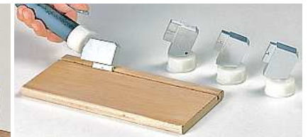
PZ0024-PZ0028 4/5/6/8/10 mm