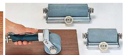
PZR0034-PZR0036 72/120/180 mm