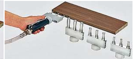
PZ0012-PZ0015 6/8/10/12 mm