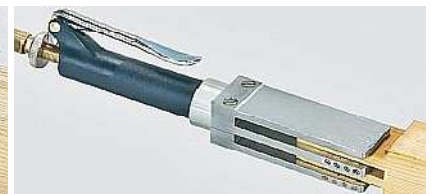
PZ0053 *3 30/40/50xXxX mm