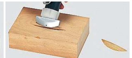
PZ0154 XxXxX mm