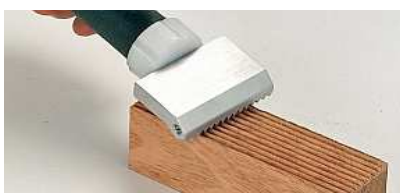
PZ0029 XxXxX mm