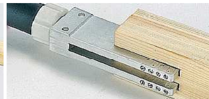
PZ0078-PZ0079 *2 30/40/50xXxX mm