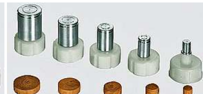
PZ0106 - PZ0109 15/20/25/30 mm